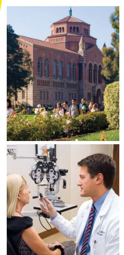
The UCLA Stein Eye Institute is a world-

A UCLA deferred charitable gift annuity gives you all the advantages of an immediate charitable gift annuity plus the added flexibility of timing and increasing your annuity payments to enhance your financial plans.